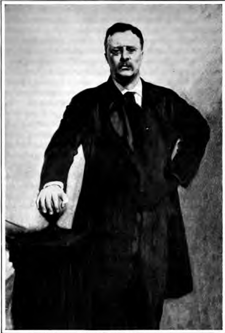
From a painting by John S. Sargent.